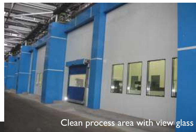
Clean process area with view glass