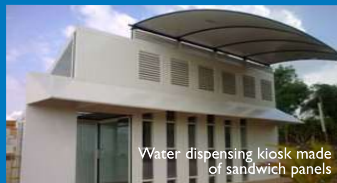
Water dispensing kiosk made of sandwich panels

INSULATION: Rigid Polyurethane foam (PUF) Density = 40Kg/m 3 ± 2 Kg/m 3