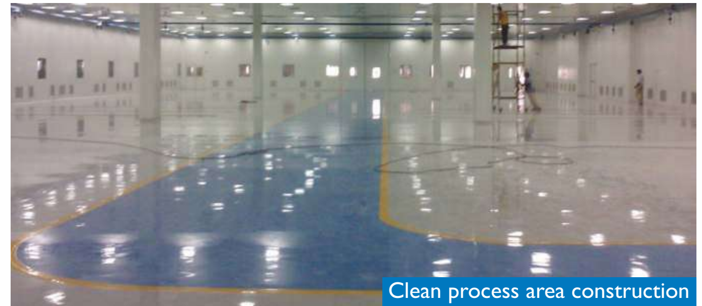
Clean process area construction