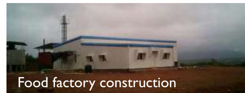
Food factory construction